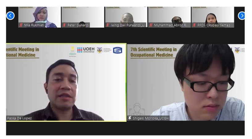
During discussion session