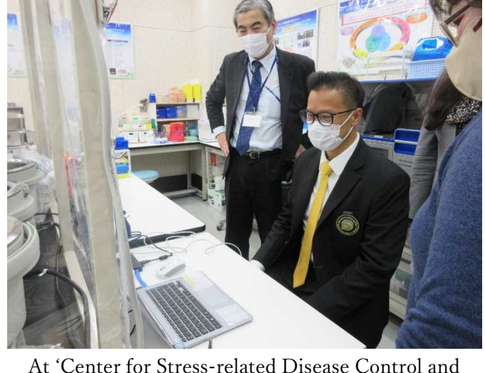
At 'Center for Stress-related Disease Control and Prevention'