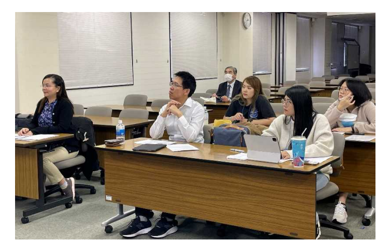
Lecture in progress

The course participants received lectures on health checkup, roles of occupational physicians, mental health, occupational health of aging workers and assessment methods of work environment as well as most recent research on occupational medicine from UOEH faculty members. In addition to the lectures, the participants visited local factories and health checkup facilities and received opportunities to get insights from the occupational physicians. The training course was successful, and the course will enable participants to improve their practice of occupational health in Thailand. At last, we would like to extend our gratitude to all the staffs of visited sites and university for their dedicated cooperation.