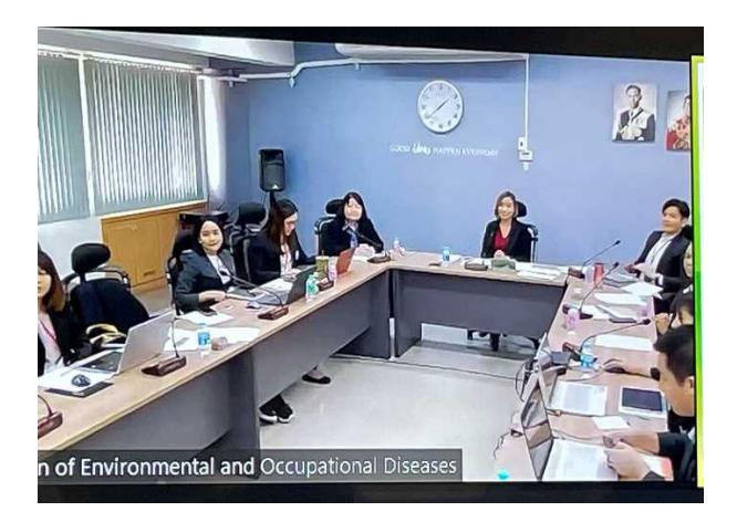
Online participants at DDC, Ministry of Public Health, Thailand