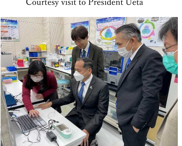
At Center for Stress-related Disease Control and Prevention