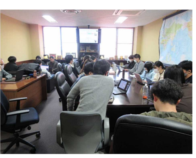
Onsite participants of UOEH