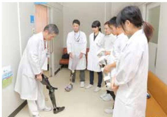
臨床実習 On-the-job Clinical Training