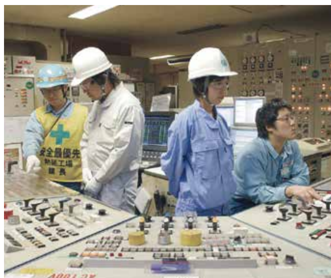
産業医学現場実習 On-the-job Training for Occupational Medicine