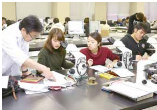
基礎医学実習 Laboratory Work