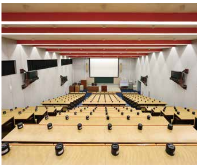
大学2号館講義室 Building No.2 Lecture Room