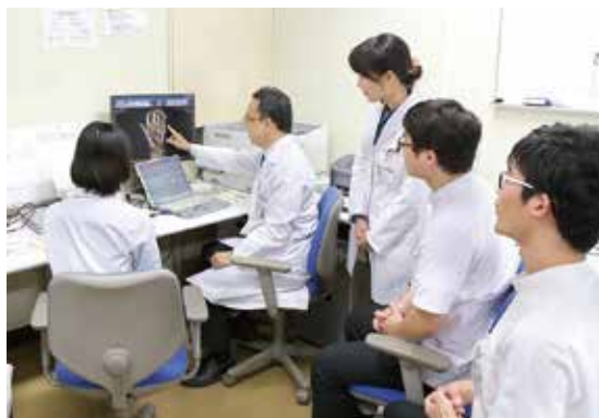
臨床実習 On-the-job Clinical Training