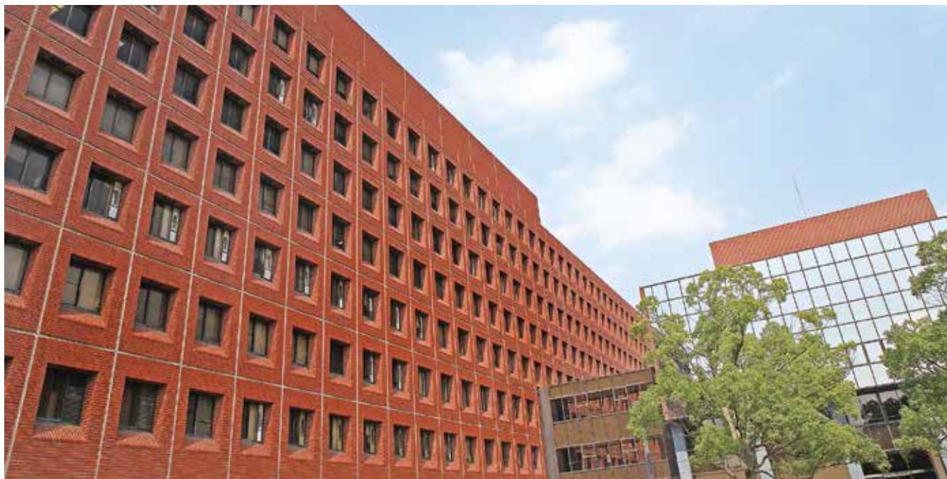
大学1号館 Building No.1

Approaching health and environments of working people through the eyes of medical science, occupational health physicians play extremely important roles for several reasons, including their support for the development and revitalization of industry. The School of Medicine trains occupational health physicians with rich humanity that enables them to consider medical science more deeply and from wider perspectives in industrial society.