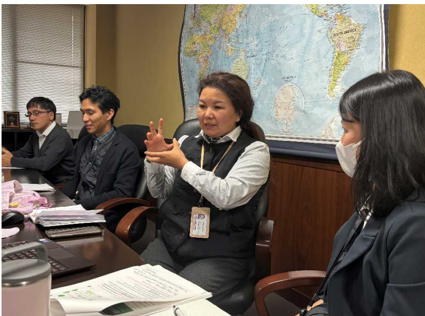
Presentation by UOEH students