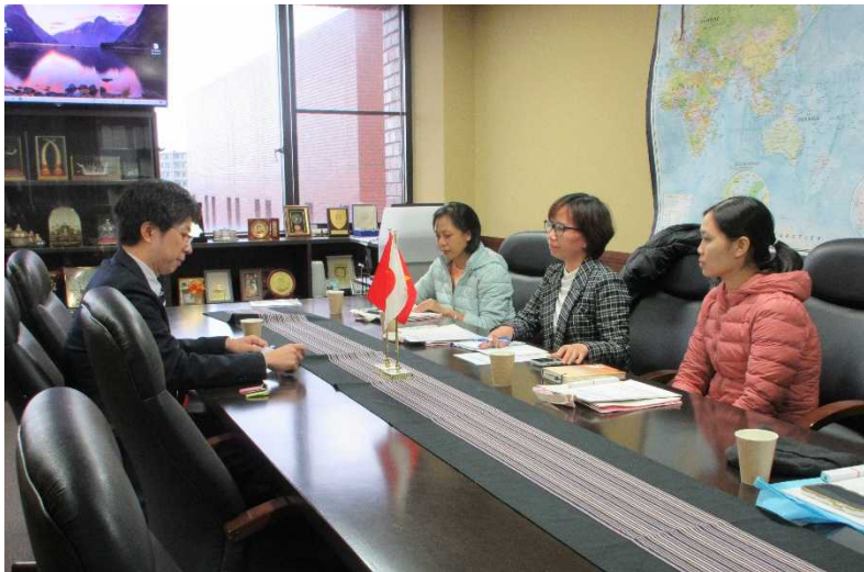
Introduction of UOEH

The purpose of this training program was to enable them to effectively utilize the analytical equipment already available at the National Institute of Occupational and Environmental Health, Vietnam and to advance their research in their home country by learning about the analyses and research conducted at our university. During the program, faculty members from the School of Health Sciences and the Institute of Industrial Ecological Sciences provided lectures and practical sessions. The three participants were notably proactive in asking questions related to their work back home.