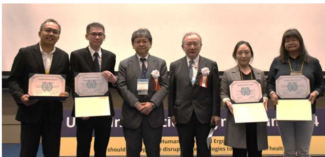
Excellent Poster Awardees