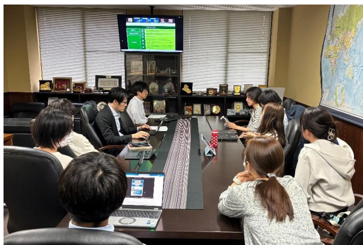
Part of the UOEH participants

The 10th forum was hosted by the University of Indonesia, and the presentation on the theme of "Zoonotic Transmission Potential of Hepatitis B Virus Among Veterinarians Working in Orangutan Conservation" was provided. Approximately 100 participants joined the forum online, and they participated in lively discussions following the presentation.