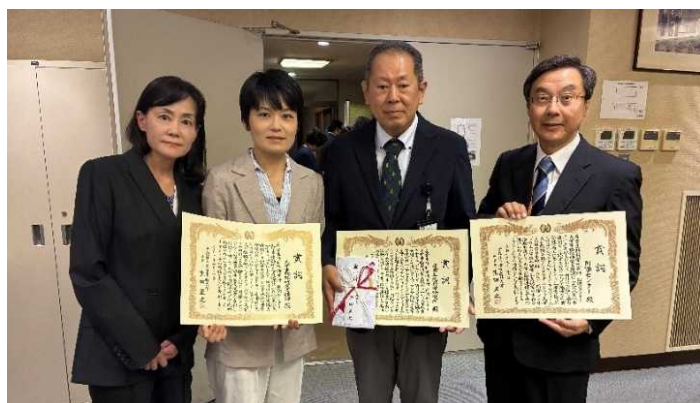
Representatives from IIES, International Center and Research Support Section

We would like to take this opportunity to express our sincere gratitude to all individuals and organizations, both within and outside of UOEH, who have supported the activities of the International Center. We remain committed to promoting international cooperation and exchange and will continue our efforts to contribute to further advancement.