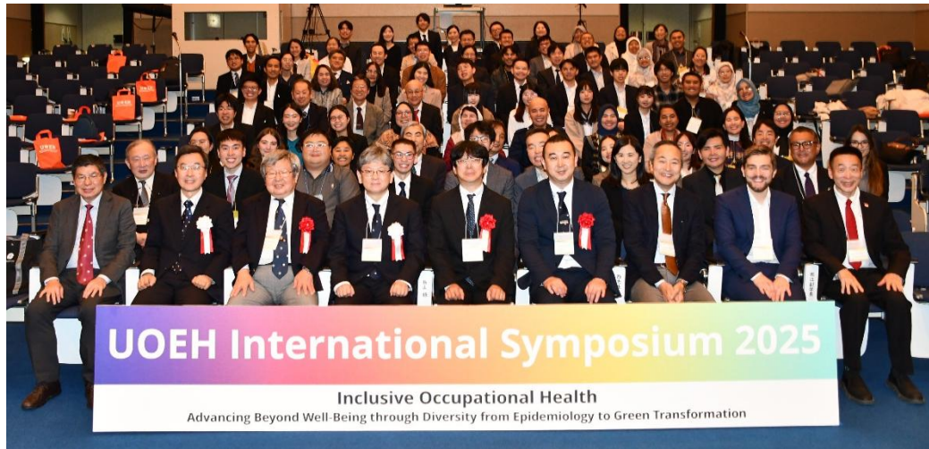
Commemorative photograph (Day 1)