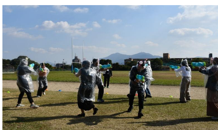
Workshop (Poi-poi battler)