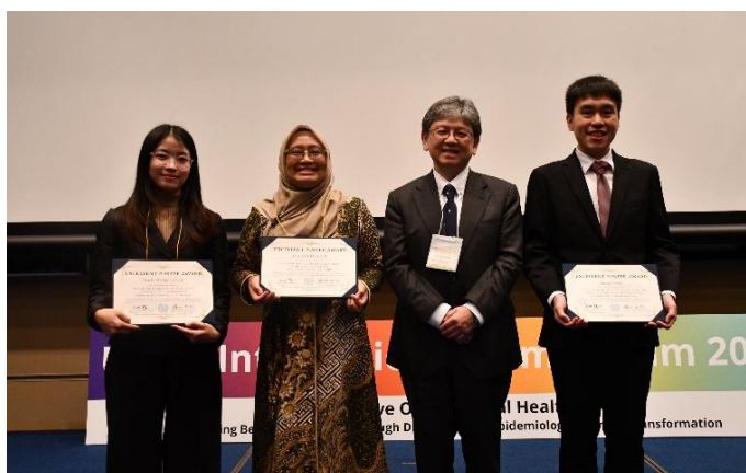
Excellent Poster Awardees