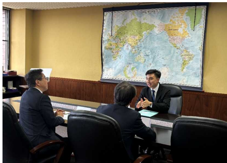
From the ceremony